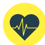
Women's, Children's Adolescents' Health