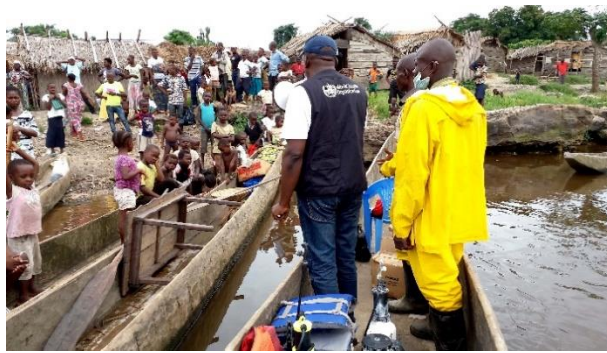
DRC cholera preparedness