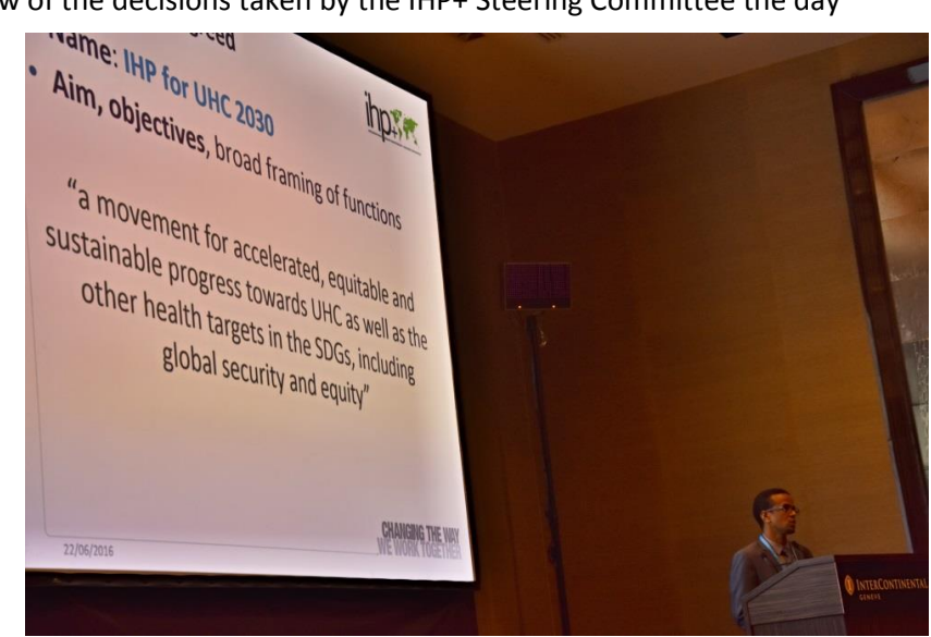
State Minister Amir Hagos, Ethiopia, presents IHP+ Steering Committee decisions

before<sup>3</sup>: Changing IHP+'s name to the International Health Partnership for UHC 2030, the need for a revised Global Compact, and to have a transitional Steering Committee overseeing the transformation of IHP+ to IHP for UHC 2030.