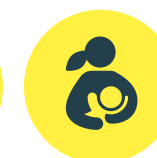
Women's, Children's Adolescents' Health