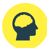
Non-communicable Diseases/ Mental Health